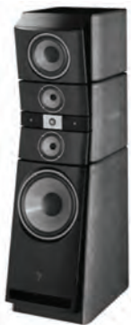
Focal.JMlab the Spirit of Sound