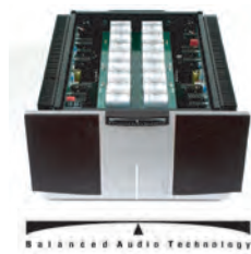
BALANCED AUDIO TECHNOLOGY